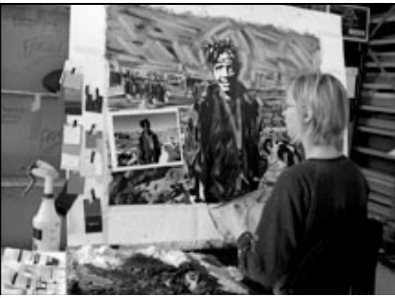
Exhibit runs through 31 January

Backyards & Beyond is sponsored in part by the Mississippi Humanities Council, DSU Special Programs Committee, DSU Year of the Arts, and the AAUW.